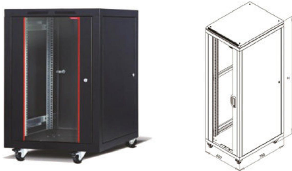
19" 600x800mm Cosmoline Cabinet Width: 600mm Depth: 780mm