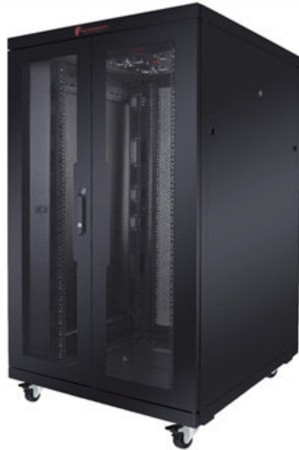
19" 800x1000mm Cosmoline Cabinet With: 780mm Depth: 1000mm