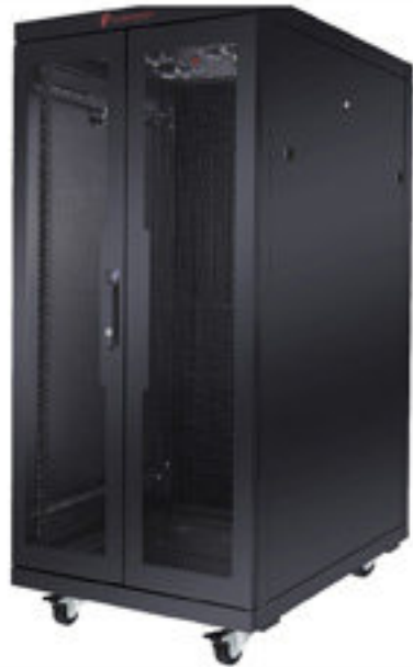
19" 600x1000mm Cosmoline Cabinet With: 600mm Depth: 1000mm